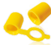
Grease Nipple Caps 油脂嘴帽 GPN 980