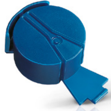
TAILORED SOLUTIONS 量身定制的解决方案

KAPSTO® standard range (2017-07-10) KAPSTO® 标准产品系(2017-07-10)