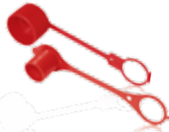
Protective Dust Caps 防尘盖 GPN 920/930