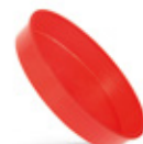
Thin Walled Tapered 薄壁锥形套件套塞 GPN 601/602